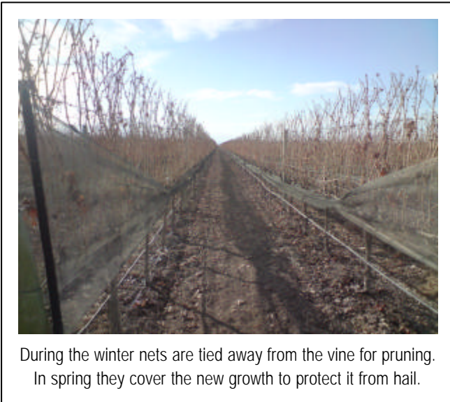
During the winter nets are tied away from the vine for pruning. In spring they cover the new growth to protect it from hail.

makes it over the mountains (250mm in an average year) generally falls in the summer. However, the risk of it failing as hail in spring means many vines disappear under swathes of netting.