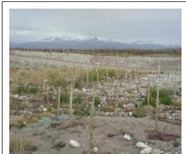
One of many new vineyards high in the Andes foothills in the Uco Valley. The Andes are shrouded in falling snow.

The most exciting region of Mendoza has to be the Central region, based around the Uco Valley. Here the vineyards sit inside the Andes foothills and altitudes can reach 1400m. The region enjoys a large thermal amplitude (difference between day and night temperatures) which allows the fruit to retain its primary